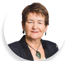
Hon. Ruth Richardson